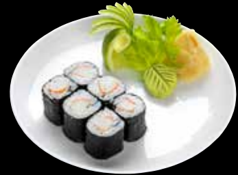
KANI MAKI Surimi Crab