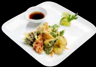
YASAI TEMPURA Batter-Fried Selected Vegetables, Tentsuyu Sauce