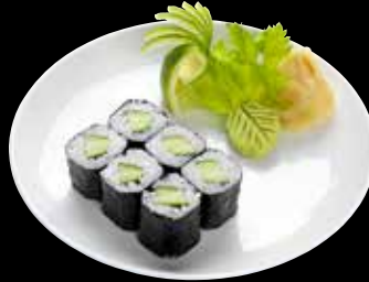
KAPPA MAKI Cucumber