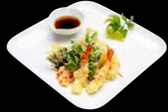
TEMPURA MORIAWASE Batter-Fried Prawns, Japanese Amberjack, Vegetables, Tentsuyu Sauce