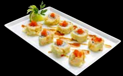
SAMURAI TEMPURA* Batter-Fried Rolls, Salmon, Japanese Amberjack, Surimi Crab, Masago Roe

If you have any allergy or sensitivity to specific foods, please notify our staff before ordering. * Public Health advisory: Consuming raw or undercooked meats (poultry, beef, lamb, pork, etc.), seafood, shellfish or eggs may increase your risk of food borne illness, especially if you have certain medical conditions. All pictures shown in this menu are for reference only.