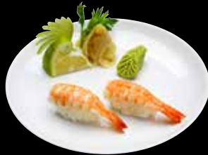
EBI Cooked Shrimps