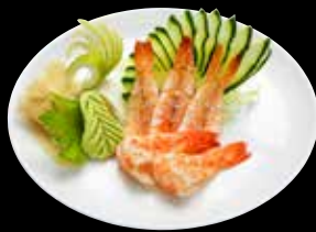
EBI Cooked Shrimps