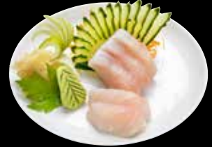
HAMACHI* Japanese Amberjack