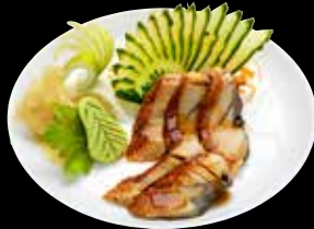
UNAGI Roasted Glazed Eel