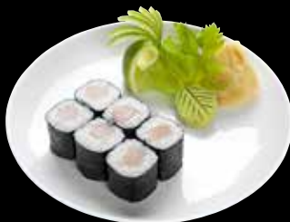
TAI MAKI* Red Snapper