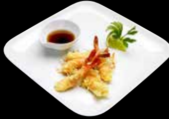
EBI TEMPURA Batter-Fried Prawns, Tentsuyu Sauce