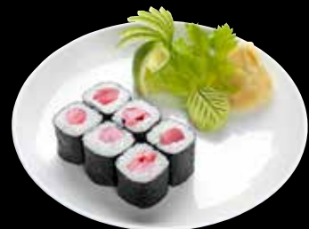
MAGURO MAKI* Yellowfin Tuna

If you have any allergy or sensitivity to specific foods, please notify our staff before ordering. * Public Health advisory: Consuming raw or undercooked meats (poultry, beef, lamb, pork, etc.), seafood, shellfish or eggs may increase your risk of food borne illness, especially if you have certain medical conditions. All pictures shown in this menu are for reference only.