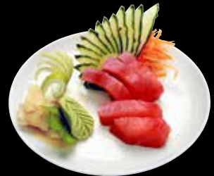
MAGURO* Yellowfin Tuna

If you have any allergy or sensitivity to specific foods, please notify our staff before ordering. * Public Health advisory: Consuming raw or undercooked meats (poultry, beef, lamb, pork, etc.), seafood, shellfish or eggs may increase your risk of food borne illness, especially if you have certain medical conditions. All pictures shown in this menu are for reference only.