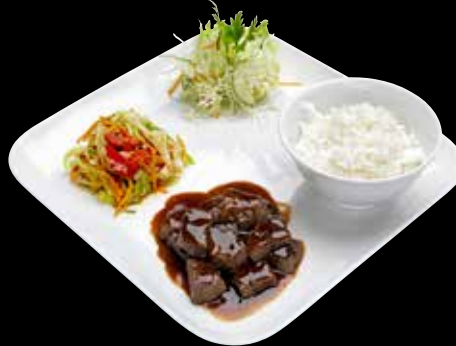
GYU NIKU TERIYAKI* Angus Tenderloin, Teriyaki Sauce, Steamed Rice, Sautéed Vegetables

If you have any allergy or sensitivity to specific foods, please notify our staff before ordering. * Public Health advisory: Consuming raw or undercooked meats (poultry, beef, lamb, pork, etc.), seafood, shellfish or eggs may increase your risk of food borne illness, especially if you have certain medical conditions. All pictures shown in this menu are for reference only.