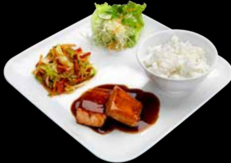
SAKE TERIYAKI* Grilled Salmon, Teriyaki Sauce, Steamed Rice, Sautéed Vegetables