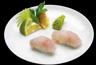
HAMACHI* Japanese Amberjack