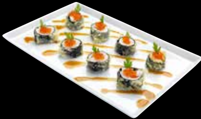
TIGEREYE TEMPURA* Batter-Fried Rolls, Japanese Amberjack, Cream Cheese, Salmon Roe