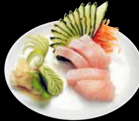
TAI* Red Snapper