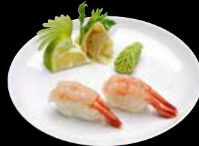
AMA EBI* Raw Shrimps