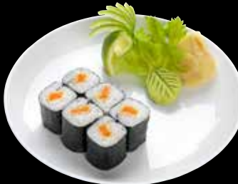
KABOCHA MAKI Pumpkin