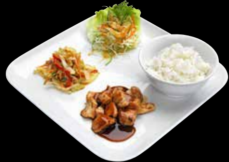
TORI TERIYAKI Grilled Chicken, Teriyaki Sauce, Steamed Rice, Sautéed Vegetables