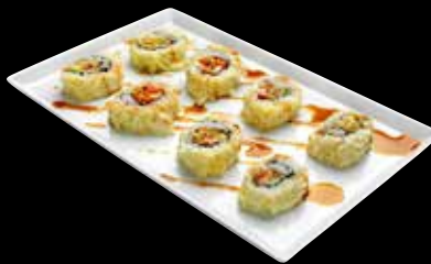
YASAI MAKI TEMPURA Batter-Fried Vegetable Rolls, Cream Cheese