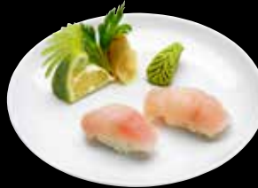
TAI* Red Snapper