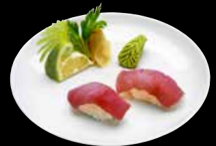
MAGURO* Yellowfin Tuna

If you have any allergy or sensitivity to specific foods, please notify our staff before ordering. * Public Health advisory: Consuming raw or undercooked meats (poultry, beef, lamb, pork, etc.), seafood, shellfish or eggs may increase your risk of food borne illness, especially if you have certain medical conditions. All pictures shown in this menu are for reference only.