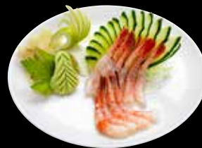
AMA EBI* Raw Shrimps