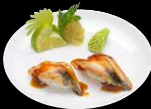
UNAGI Roasted Glazed Eel